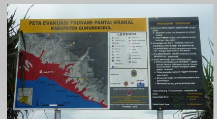
Billboard with evacuation map produced using Quantum GIS