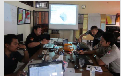
The follow up training