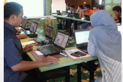
The basic Quantum GIS

Quantum GIS is free open source GIS software and is promoted together with Open Street Map and the plugin InaSAFE by BNPB / AIFDR.